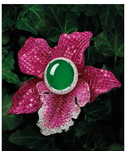
Lot 213 Jadeite, Ruby and Diamond "Orchid" Brooch / Ring

legendary Monkey King riding on the clouds and mist, to highlight the captivating colours and considerable thickness of the jadeite, demonstrating a perfect marriage of natural jadeite and craftsmanship.